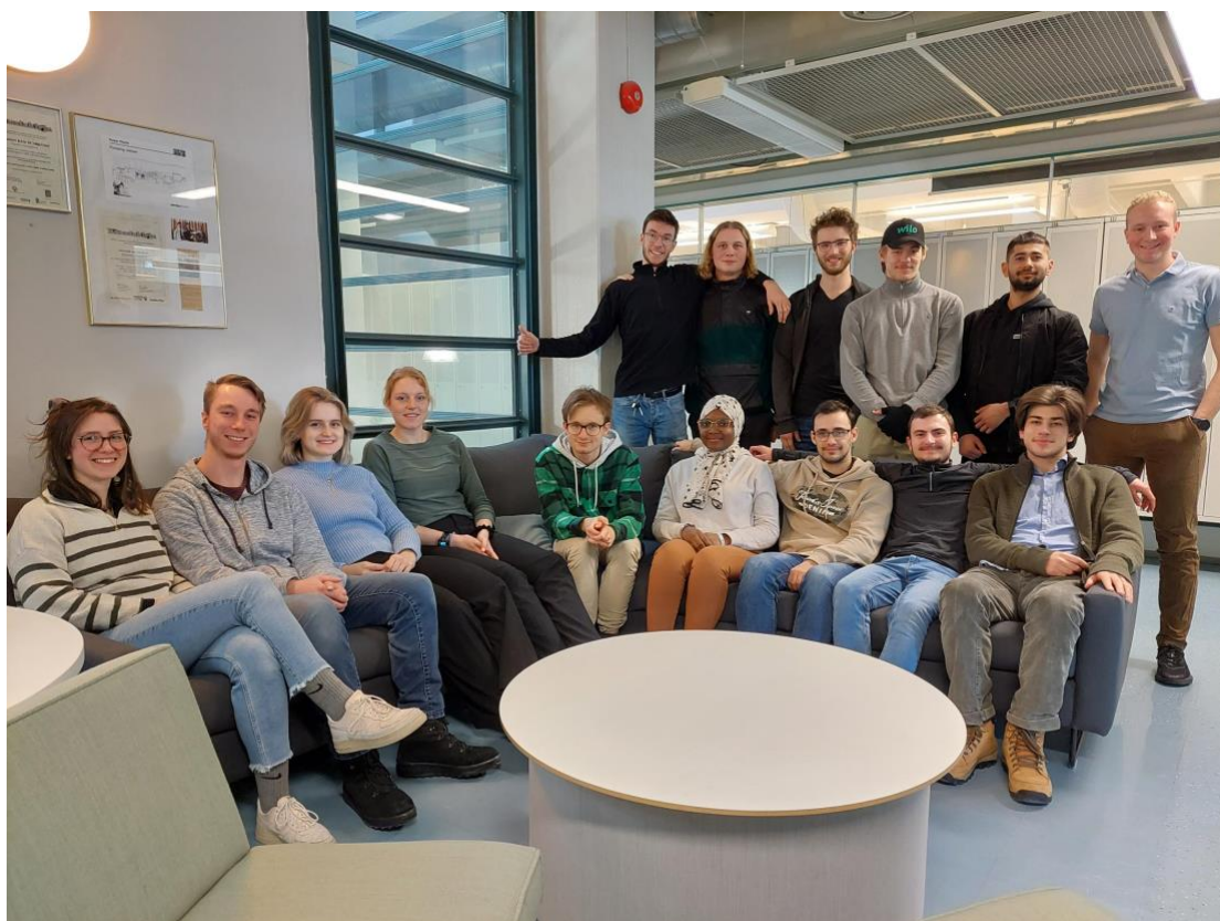
The EPS-group from Spring 2023