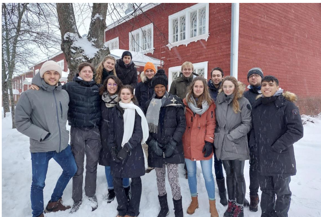
The EPS-group from Spring 2022